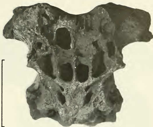
Fig. 4. Rostral view, PM 526. Line represents 10 cm.